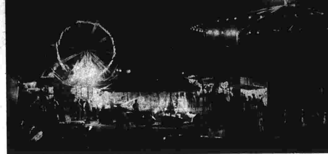
Evening at St. Bernard's Church Bazaar in Rockville